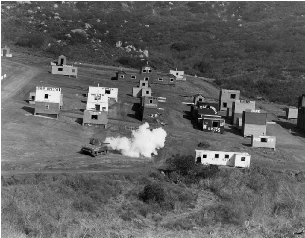
Figure 6 An M-26 tank of the 1st Tank Battalion is shown softening up the “enemy” in the mock town at Camp Pendleton, California, 3 February 1950

historic survey, “Their primary purpose was to train personnel in the use of organic weapons in a combat environment, with a secondary purpose of mental conditioning.” 8 Mental conditioning consisted of subjecting troops to continual fire overhead and at their flanks (Figure 7). The central logic is that it is better for soldiers to “die” in training, where they can learn something from the experience.