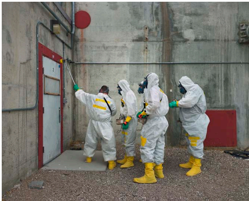
Figure 5 Paul Shambroom, radiation check, National Center for Combating Terrorism, Nevada Test Site, 2005 (courtesy of the artist)

Simulation training is nothing new. Mock villages were a common component of U.S. military training by the start of World War II, but examples in the United States can be found as early as 1917. They were fashioned to mimic the terrain of the anticipated enemy (Figure 6). A scaled German village was used to practice scenarios during European conflicts. As the political map changed, so did the replicas. Using authentic materials whenever possible, the military constructed mock settlements representing Japan, Korea, Russia, Vietnam, and the homeland. As stated in a recent