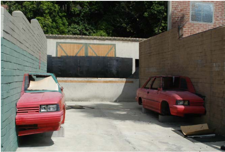
Figure 3 Section of the Practical Combat Range at the LAPD's Police Academy, 2004