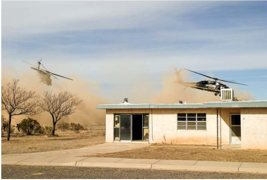
Figure 1 Steven Rowell, Playas townsite, New Mexico, 2008