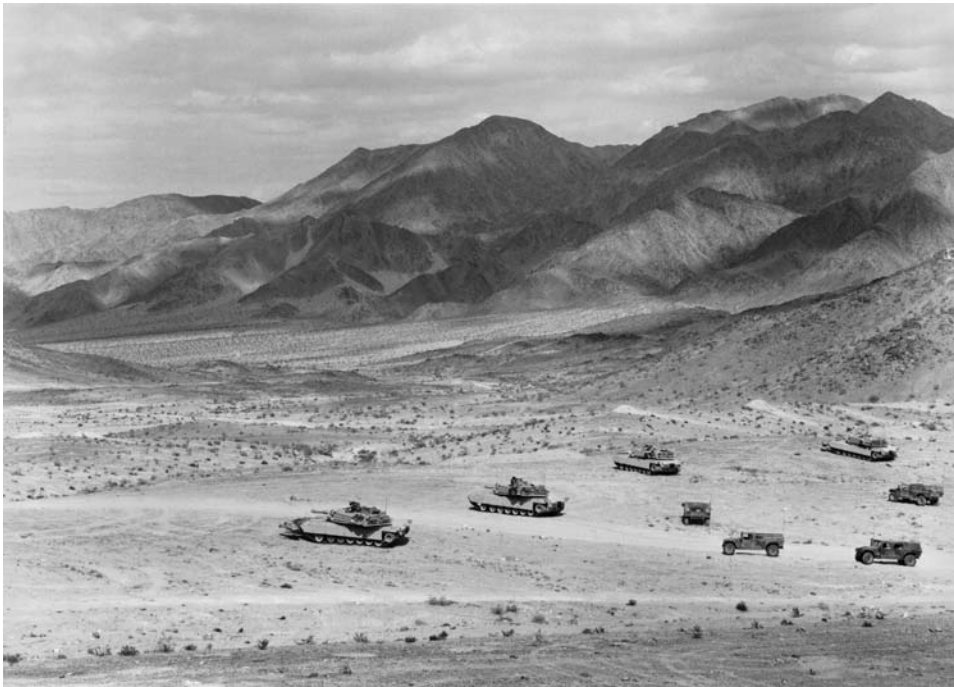
Figure 12 An-My Lê, 29 Palms: Mechanized Assault , 2003–4 (courtesy of the artist and Murray Guy Gallery, New York)

In Small Wars , we see black-and-white landscapes depicted on a cinematic scale. The activities of battle are somewhat camouflaged in shadow and texture. The results are uncanny, and we cannot believe our eyes. The military is everywhere yet invisible within the landscape, literally and metaphorically omnipresent. In these pictures, we can choose to see the military or we can choose to see the landscape; it is our decision (Figure 12). Tanks crawling across a desert floor could be in Afghanistan or near Las Vegas. Mountains here look like mountains there. We reflexively assume it is Afghanistan, because that place is most present in our minds. We saw it on the news today.