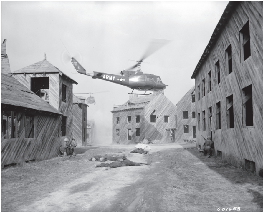
Figure 7 Army UH-1 “Iroquois” helicopters descend into the training village at Fort Campbell, Kentucky, 7 March 1963