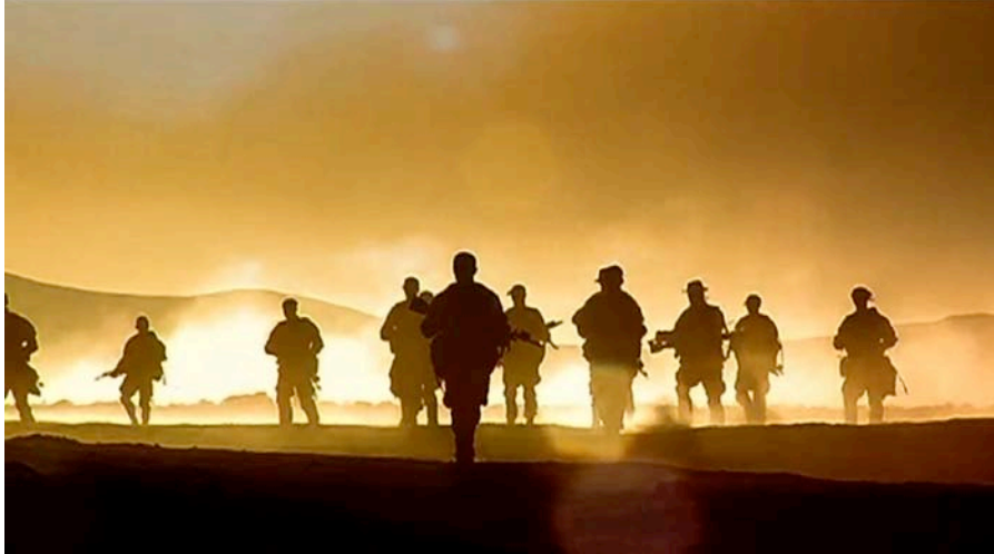
Figure 8 Tony Gerber and Jesse Moss, still from opening sequence in the film Full Battle Rattle , 2008

soldiers chuckle and stand up for lunch. Irony is rich. This blurred boundary between play and war is central to the film.